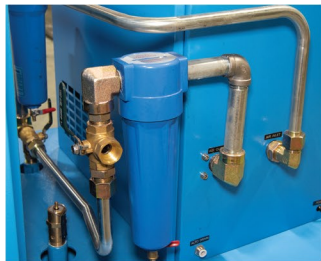
Fitted with 5 micron pre filter & 0.01 micron after filter